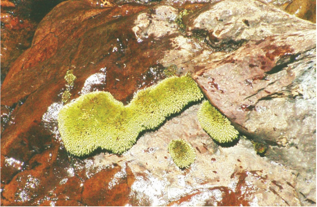
Fig. 1. Typical Afroalpine habitat of Bryum laevigatum Hook.f. & Wils.: on irrigated streambed rocks, in the gorge below Nithi Falls, ericaceous belt on the eastern slopes of Mt. Kenya, at 3280 m altitude.