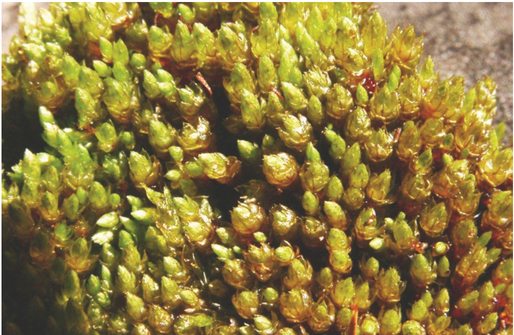
Fig. 2. Bryum laevigatum Hook.f. & Wils.: cushion closely, at the above habitat.